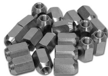
#K1034 Lugnuts - 20 pc set

6 Note: There are Left Hand and Right Hand Adapters and Spinners. These MUST be installed on the proper sides of the vehicle or the Spinners could come loose. Left Hand and Right Hand are determined as though you are sitting in the car and facing forward. While each piece is marked as to side, we recommend that you compare your hardware to Diagram 1 to ensure no errors were made during the stamping or machining process.