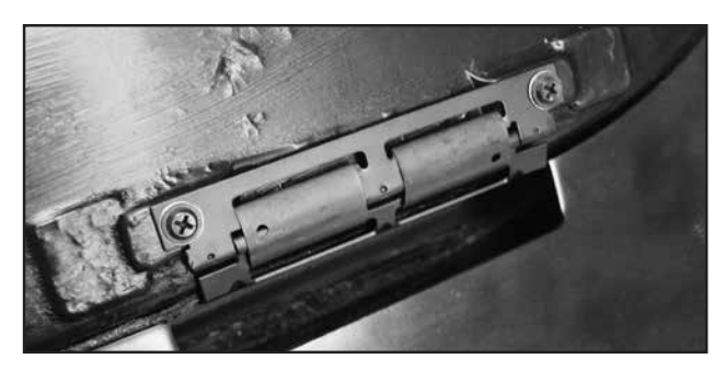
6. Use two screws to fasten the Compartment Lid onto the new panel.

5. Place hinge in position over the alignment pins and fasten all four screws.