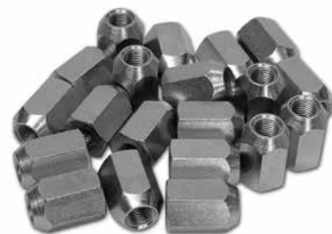
#K1034 Lugnuts - 20 pc set

6 Note: There are Left Hand and Right Hand Adapters and Spinners. These MUST be installed on the proper sides of the vehicle or the Spinners could come loose. Left Hand and Right Hand are determined as though you are sitting in the car and facing forward. While each piece is marked as to side, we recommend that you compare your hardware to Diagram 1 to ensure no errors were made during the stamping or machining process.