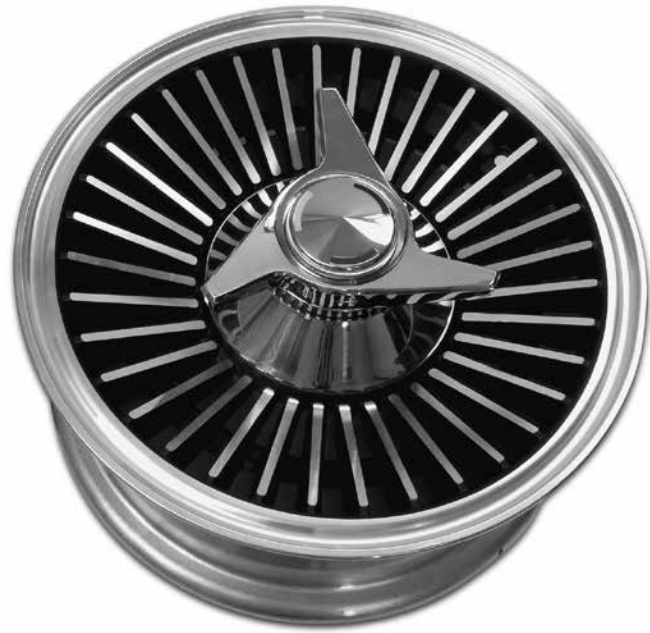
A Completely Assembled Direct-Bolt Knockoff Style Wheel