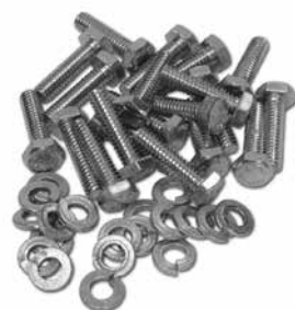
7/16" Hex Head Bolts and Lockwashers

8 Place a Cone over the Adapter on the Wheel.