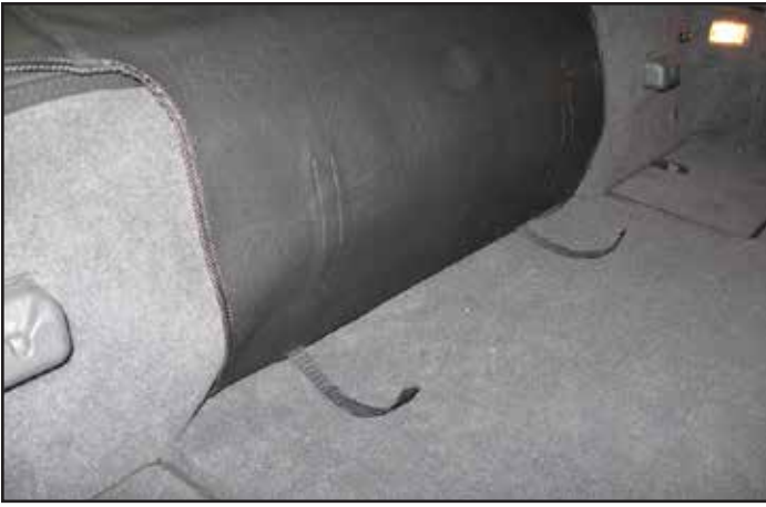
5. When rolled correctly, the Velcro that holds the Bib should be aligned as shown.