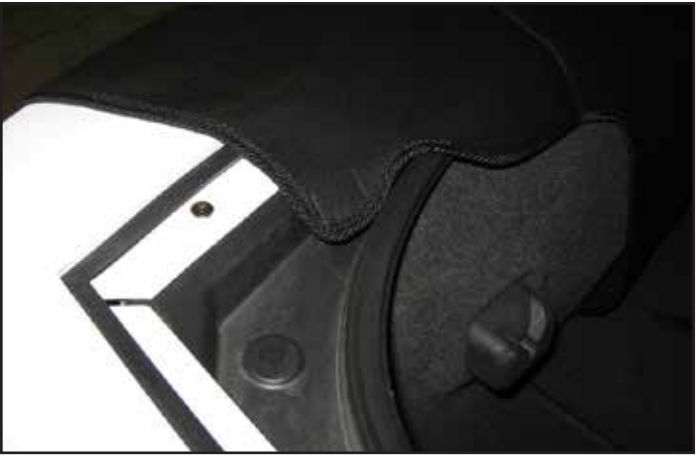
7. Velcro and possible mounting location highlighted on passenger side. The velcro pieces are not installed on our test car.