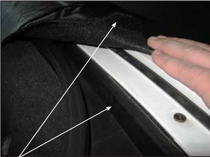
6. The kit comes with little pieces of Velcro to secure the corners of the Bib when unrolled. They go on the inside of the water-trough surrounding the trunk opening.