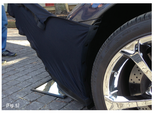
Note: the tension in the mask is normal and important to the overall performance of the product..

Stretch the mask across the front of the bumper and attach to the other side of the car.