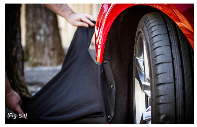
Note: the tension in the mask is normal and important to the overall performance of the product

Stretch the mask across the front of the bumper and attach to the other side of the car.